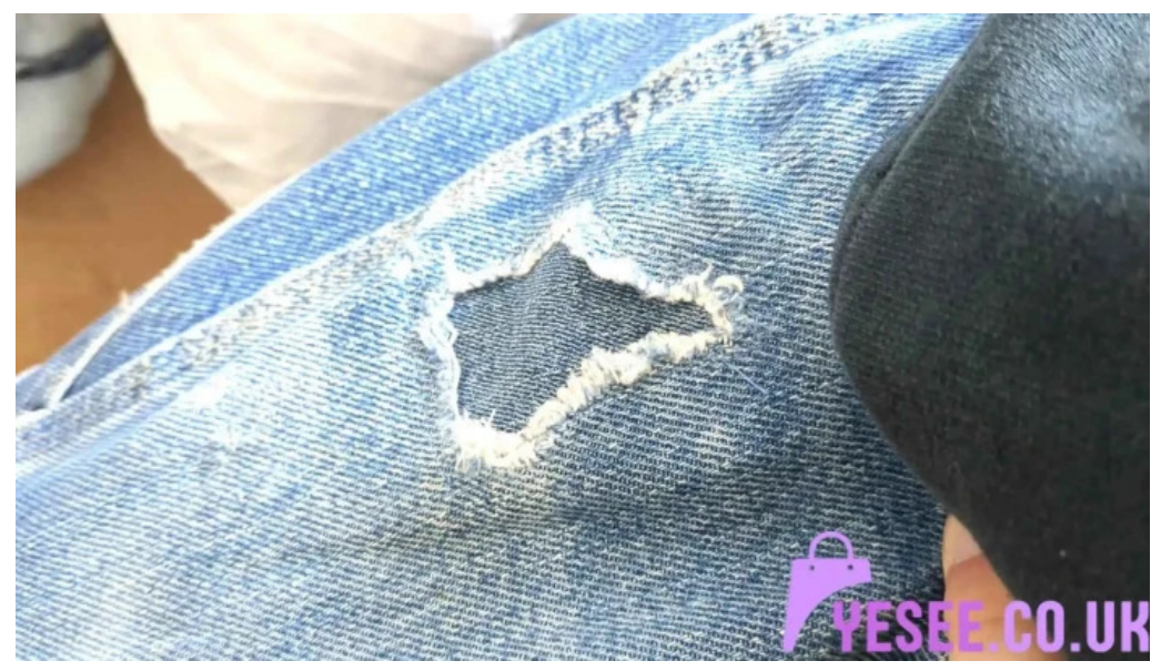
Tailoring and alterations glasgow