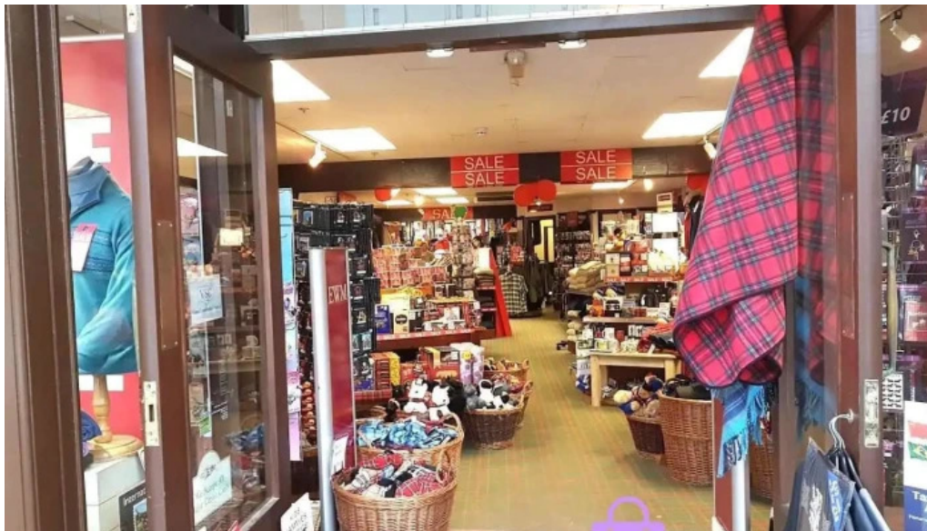
The edinburgh woollen mill st andrews