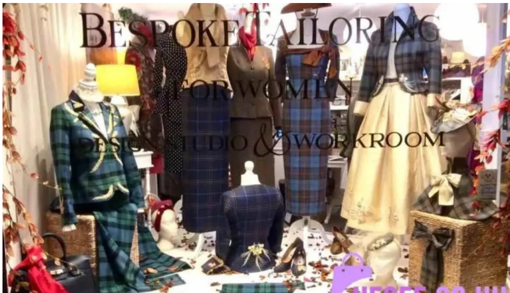
Blues browns all