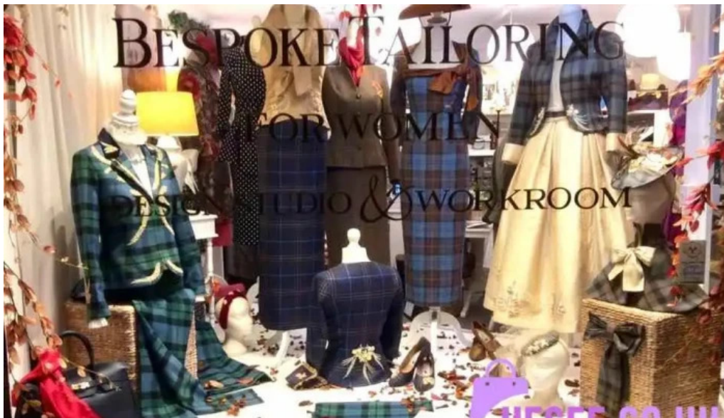
Blues browns perth