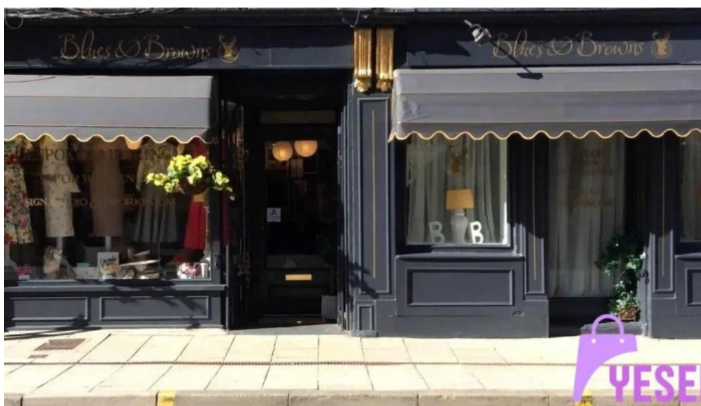
Blues browns exterior