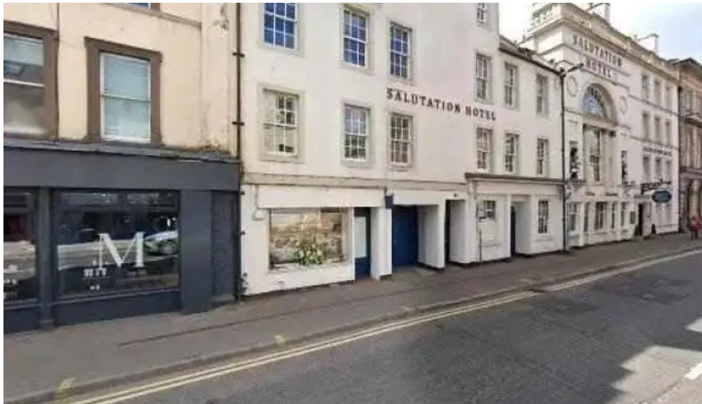
Blues browns street view 360deg