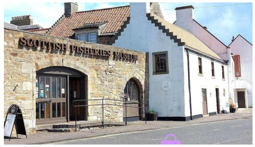
Scottish fisheries museum anstruther