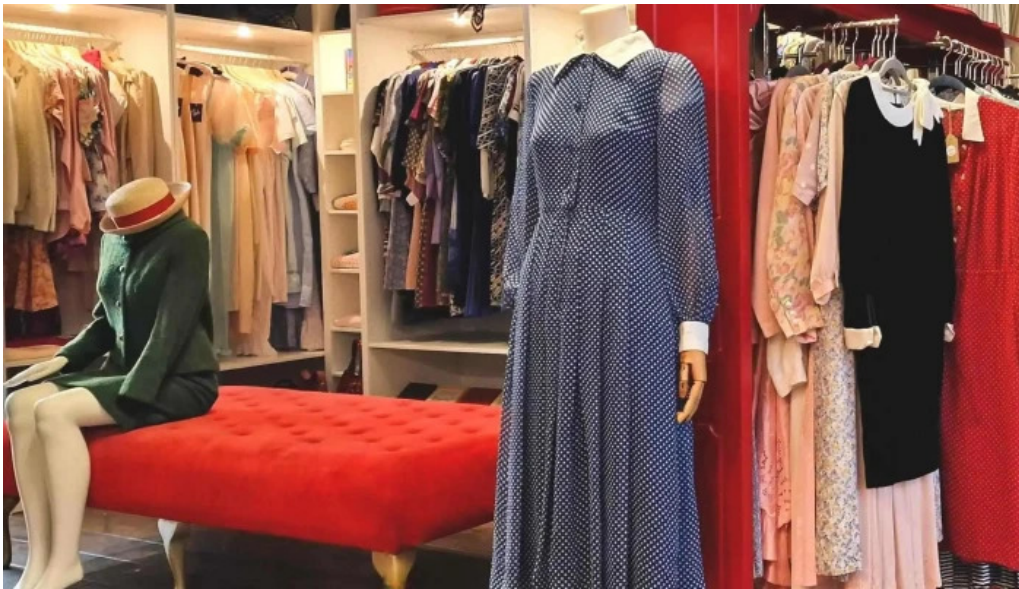
The vintage market by owner