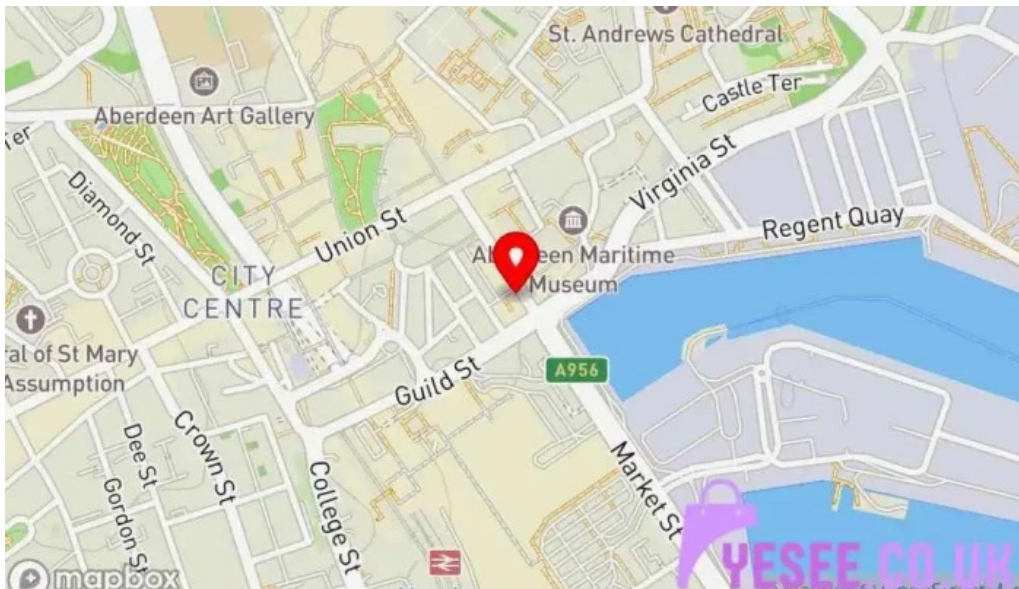
The vintage market map