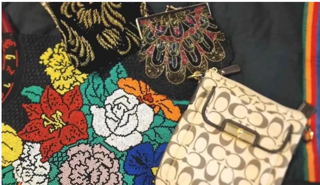
The vintage market inside