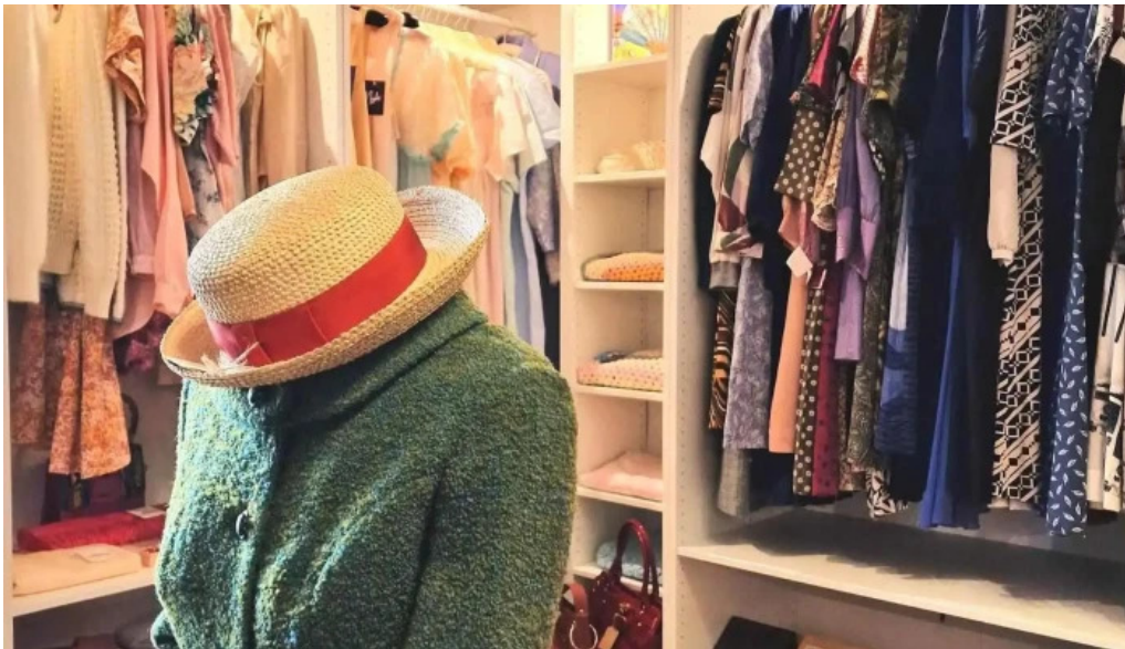
The vintage market all