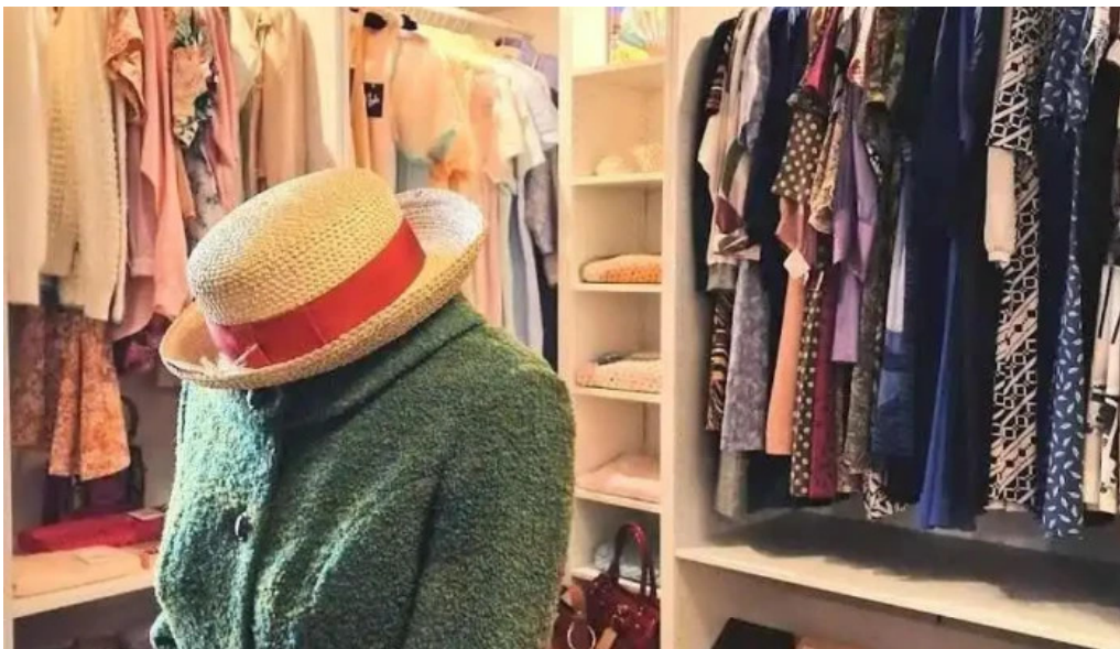
The vintage market aberdeen