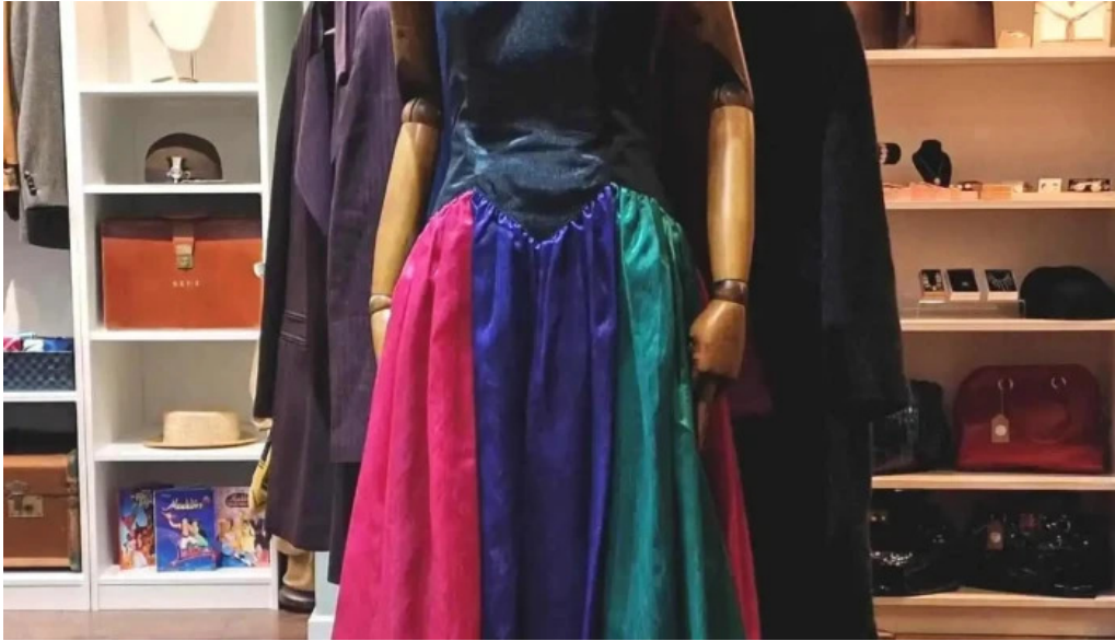
The vintage market dress