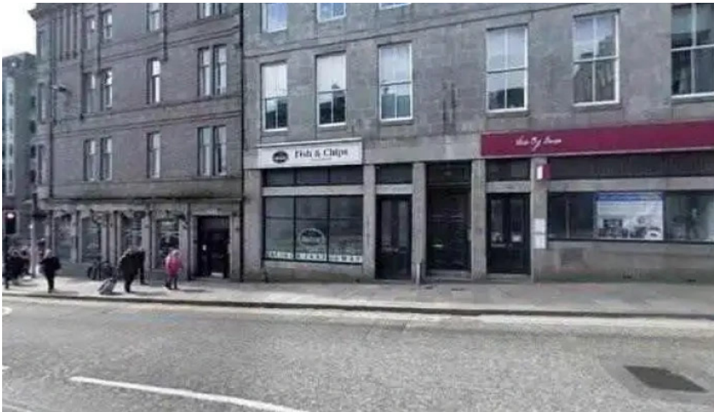
The vintage market street view 360deg