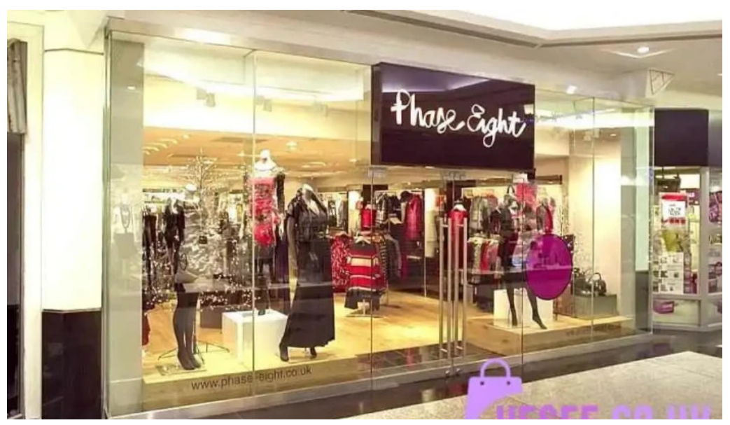
Phase eight at house of fraser alexandria