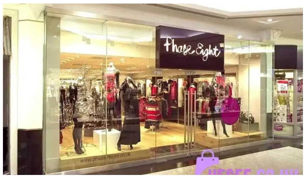
Phase eight at house of fraser all